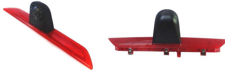
Brake Light Van Camera